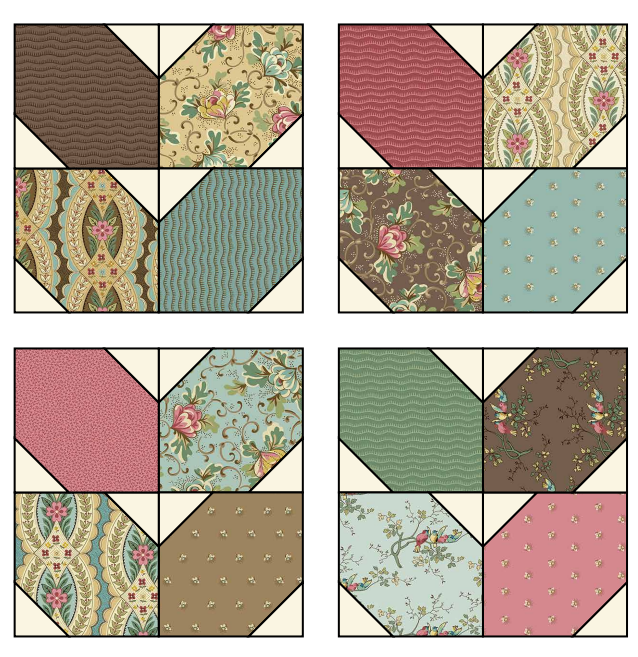
Block Y - Make 8 of each combination

2. Referring to the Block Y diagrams, arrange 4 units to make each block, noting the rotation of the units. Once you are satisfied with the fabric combinations, press seam allowances toward the Fabric B corners in 2 of the units (top left and lower right), and away from the corners in the remaining 2 units. This allows the seams to "butt" up against each other and makes joining them simpler. Sew the 4 units together to make a block. Make 8 blocks alike in each fabric combination.